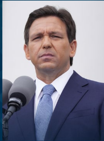
Ron DeSantis Governor 2019-2026 Former Naval Officer Attorney